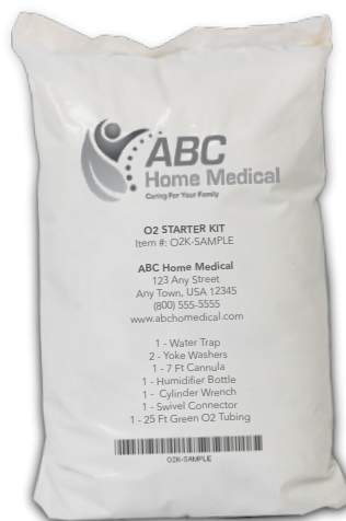
O2 Starter Kit Sample