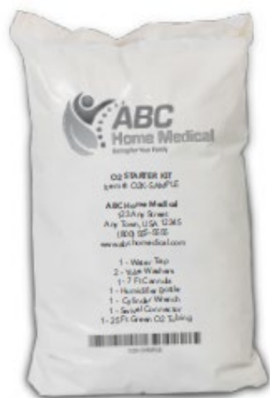
O2 Starter Kit Sample