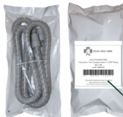
CPAP Kit Sample