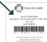
Sample Private Label