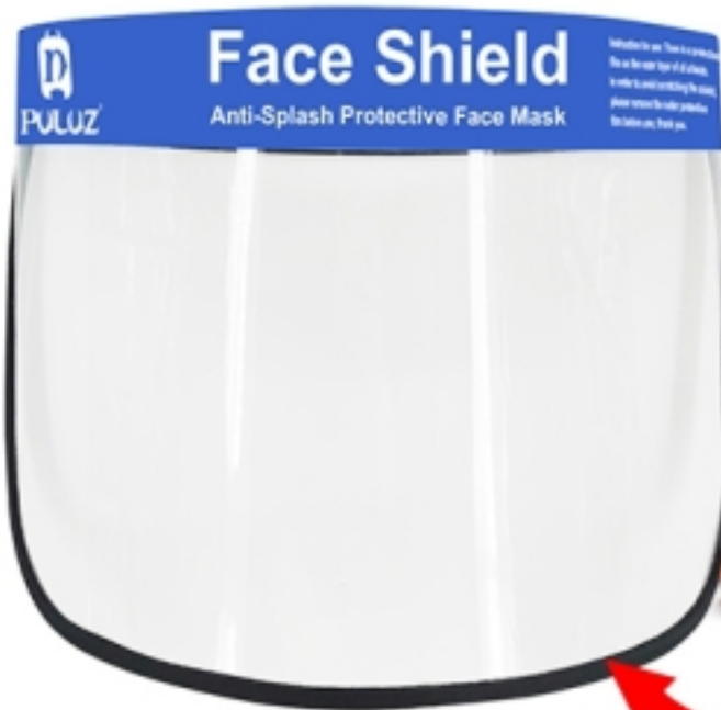
Puluz Brand: Hemming design, Prevent injuries