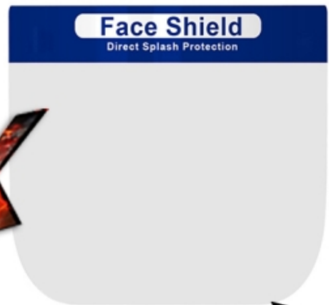
Some Other Brands: No hemming design, it's sharp